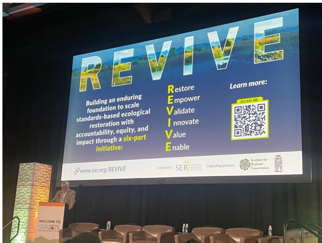
Photo caption: George Gann presenting the program REVIVE at SER2025

"Back to Natives Bash" Thanks for the Support